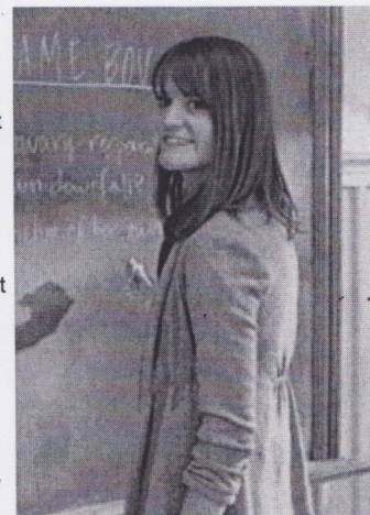
Sara Shepard on the set of Pretty Little Liars

The bus ad shows four teenage girls smirking, hinting of scandal. They're the cast of Pretty Little Liars , a new ABC series set in the tony suburbs of Philadelphia. Liars premiered in June and has been a smashing success with new episodes set to air this fall. The hit series sprang from a series of books by author Sara Shepard, who received her M.F.A. in fiction from Brooklyn College in 2004.